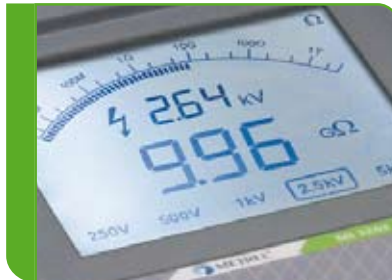
Large LCD screen with backlit