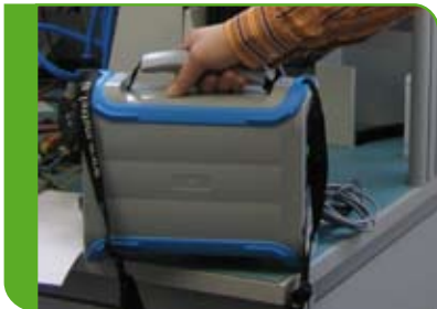
Handle and shoulder strap make the unit easy to carry