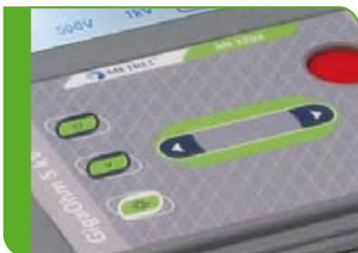
Straight forward and fast test adjustment