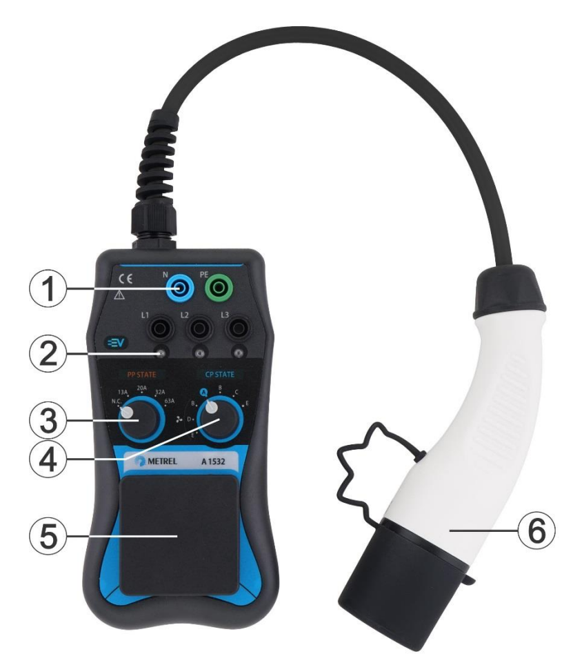
Figure 3.1: A 1532 components